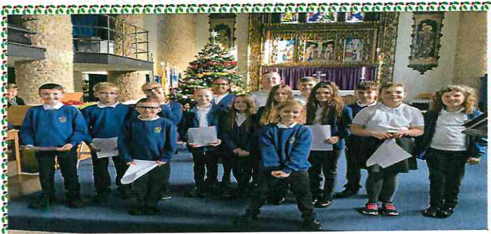
Thank you to the Y6 children who performed at St Chads church for the dementia Sunshine café. Everyone loved their performance and it brought tears to some of the audience.