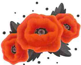
Lest we Forget

Bonfire Night: Top tips for staying safe - BBC Newsround